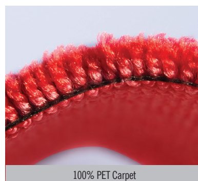
100% PET Carpet